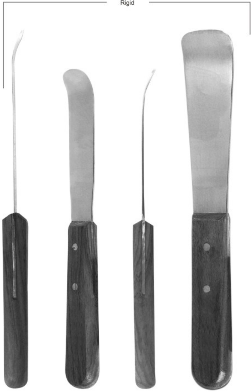
2165 Fig. 8 20 cm