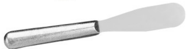
2156 All Metal Spatulas with High Polish Stainless Steel Blade